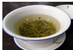
Green Tea